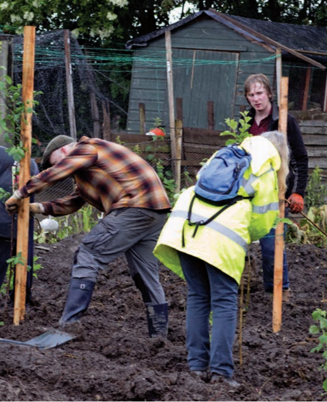
UK citizen volunteers plant a community garden.