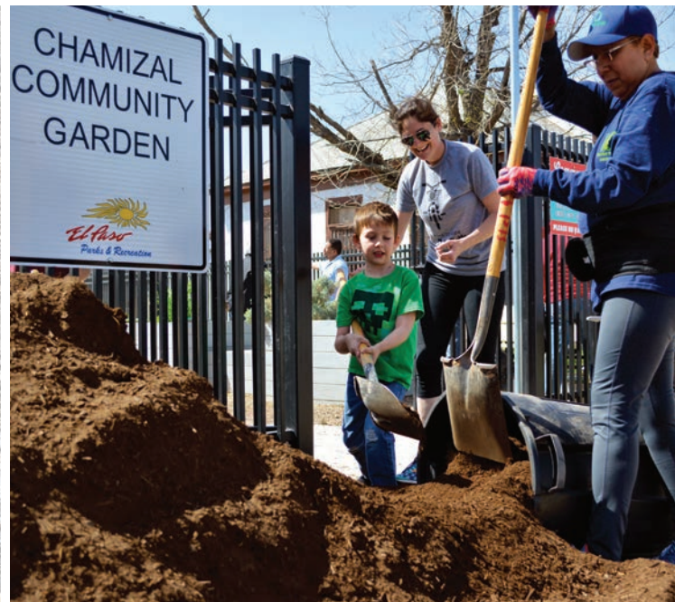
Volunteers fertilize the Chamizal Community Garden in El Paso, TX.