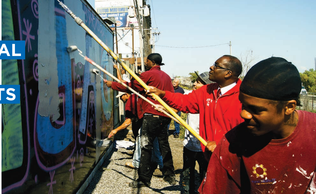
Mayor Byron W. Brown joins citizen volunteers to remove graffiti in Buffalo, NY.

Highlights from a few of our coalition cities that are doing amazing work without Cities of Service funding