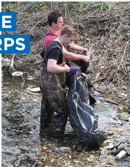
Volunteers remove debris from the Souris River in Minot, ND.

Anchorage, AK Boulder, CO Chicago, IL El Paso, TX Minot, ND New Orleans, LA Norfolk, VA Phoenix, AZ Pittsburgh, PA Tulsa, OK