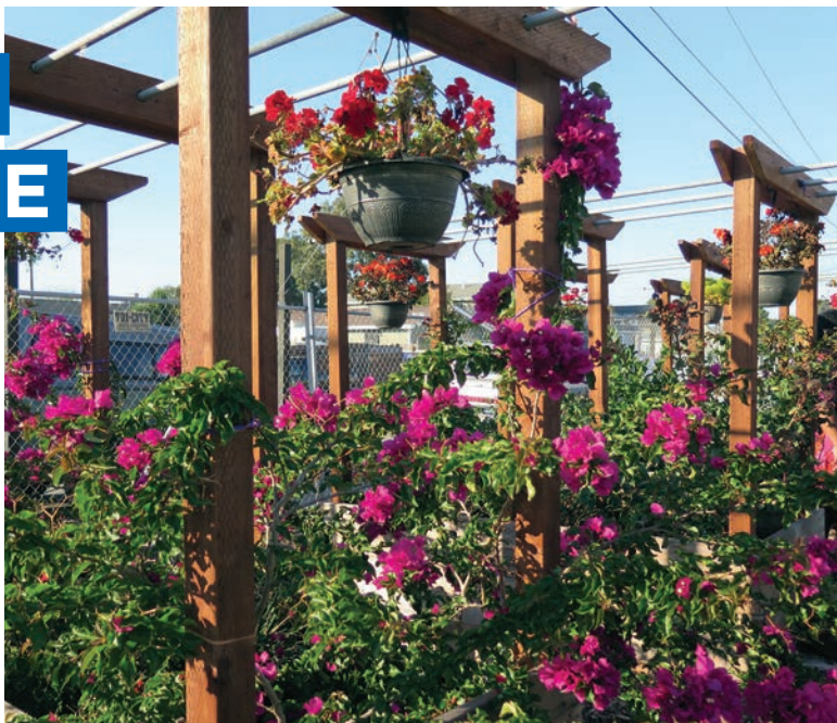
A community garden in Richmond, CA, a Love Your Block and Bay Area Resilience grantee city.

Daly City, CA Oakland, CA Richmond, CA San Jose, CA San Leandro, CA