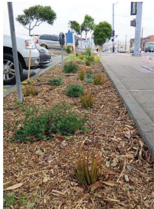
A rain garden, part of Project Green Space in Daly City, CA.