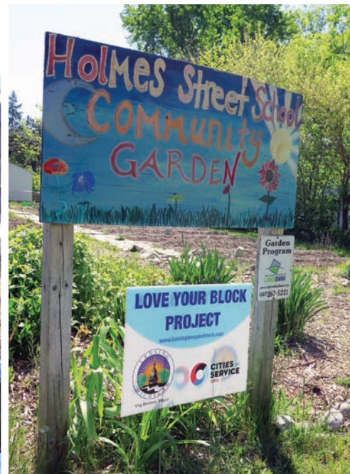
A community garden in Lansing, MI.