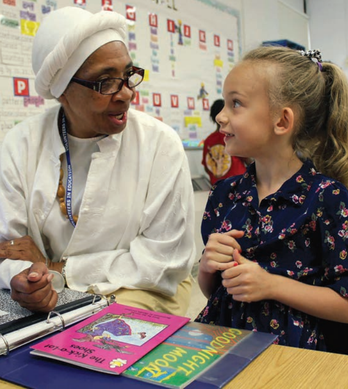
A volunteer reads with a student as part of the Virginia Beach Reads program in Virginia Beach, VA.