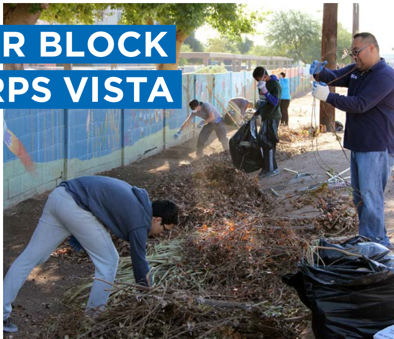
Volunteers clean brush from a canal in Phoenix, AZ.

Birmingham, AL Boston, MA Lansing, MI Las Vegas, NV Phoenix, AZ Richmond, CA Seattle, WA