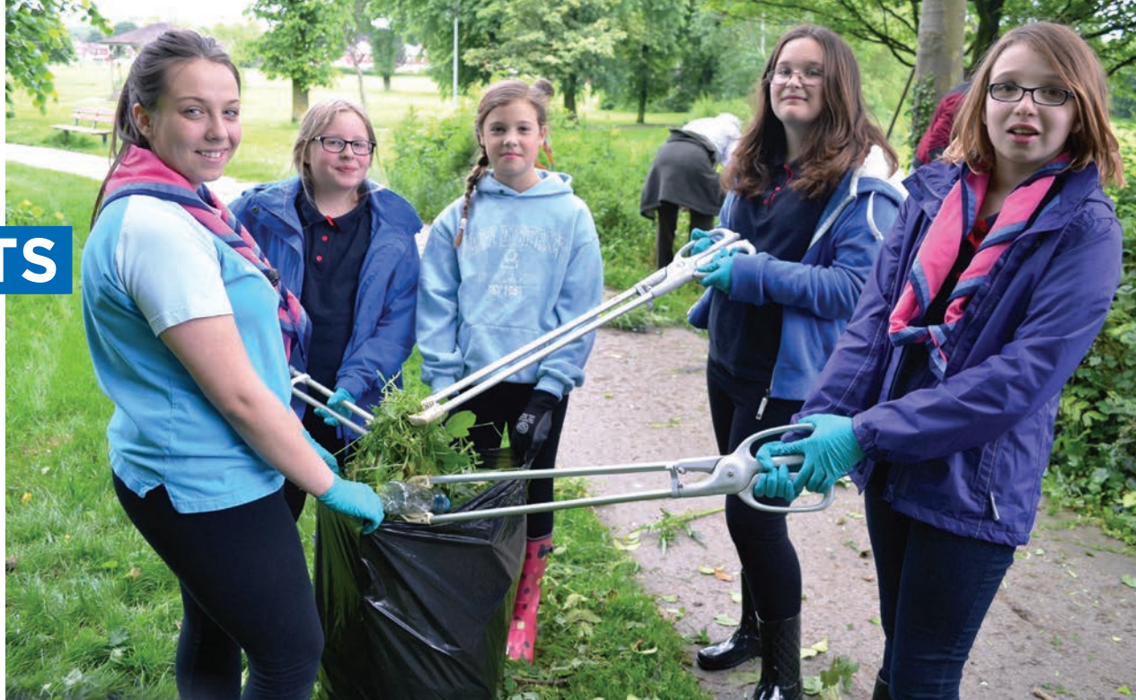
Volunteers in the city of Barnsley, UK participate in the Let's Grow program.

Barnsley, UK Bristol, UK Kirklees, UK London, UK Monmouthshire, UK Plymouth, UK Portsmouth, UK Swindon, UK Telford and Wrekin, UK