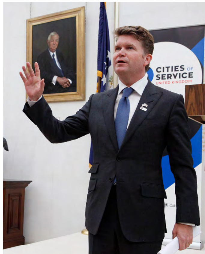
MATTHEW BARZUN US AMBASSADOR TO THE UK